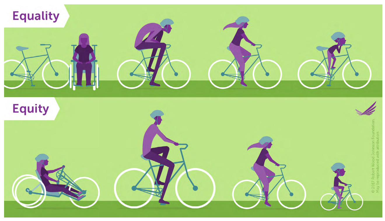
Exhibit 2: Equality versus Equity

Source: "Visualizing Health Equity: One Size Does Not Fit All Infographic," Robert Wood Johnson Foundation, June 30, 2017.